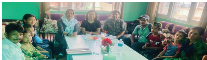
Interview and Scholarship Distribution to Students