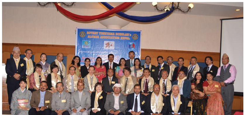
First Gathering of RYSAN in Kathmandu

Rotary Yoneyama Scholars' Alumni Nepal (RYSAN) is a not profit distribution social organization established in Nepal by the recipients of Rotary Yoneyama Memorial Foundation Scholarship in Japan. The first historic meeting for forming RYSAN was held in Kathmandu on 19th October 2013.