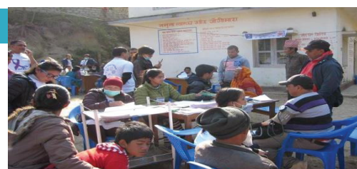
Health Camp at Jogimara, Dhading

Fourteen districts out of 77 districts in Nepal were affected by the great earthquake of 2015. RYSAN in association with Annapurna Neurological Institute and Allied Sciences (ANIAS) had conducted free Specialized Epilepsy, Mental and Dental Camp in severely affected districts (Gorkha and Dhading). These specialized free health camps were conducted on 7th January 2018 at Jogimara, Dhading and on 20th April 2019 at Ampipal Hospital, Palungtar Municipality-3, Gorkha, Nepal. A total of 413 patients were benefited from the free health camps.