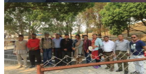
Public Toilet at Sikali Chaur, Khokana