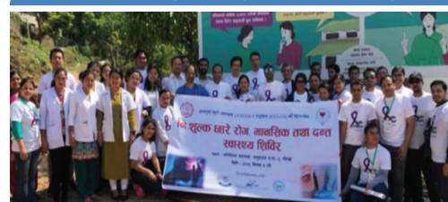
Health Camp at Aampipal Hospital Palungtar, Gorkha